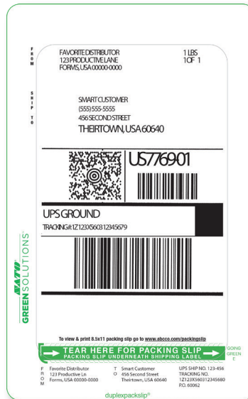
FRONT Shipping Label